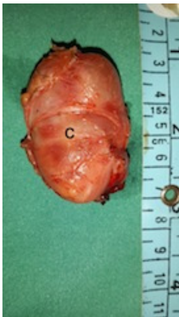
Fig. 1: Bartholin's cyst specimen following excision. C, Bartholin's cyst.